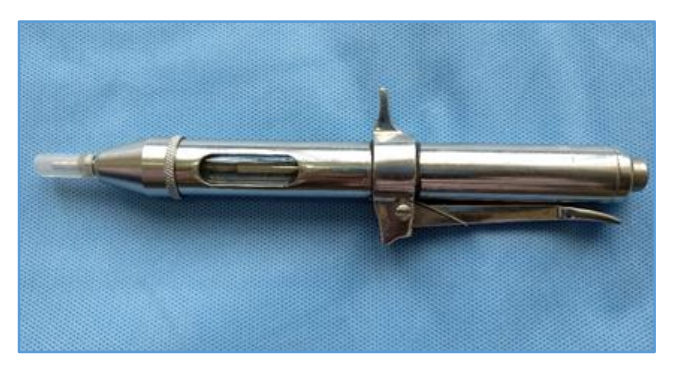
Figure 1. Jet Injector MadaJet XL (Reproduced with Permission)

Jet injector is a nearly painless, rapid, needle-free method of drug administration. Since its introduction nearly 3 decades before, it has been successfully tested and used for application of local anaesthesia in dentistry, gynaecology and podiatry as well as other medical applications<sup>10-14</sup> for intradermal and subcutaneous lignocaine administration before IV catheterisation<sup>11</sup> and for giving digital blocks.<sup>14</sup> Other uses include subcutaneous insulin, local anaesthesia for minor procedures and biopsies, and medication delivery. There are different devices commercially available for jet injection technique. We used MadaJet XL® jet injector for our study (Figure 1). Both oblique and straight spacer are available, oblique one JI may help in better visualisation of the spacer tip for delivering the anaesthesia; however, it remains a matter of personal choice.